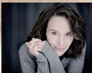
Hélène Grimaud