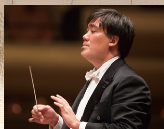
Alan Gilbert

“Spirit of Germany” performed by the genius, Alan Gilbert, and his renowned orchestra