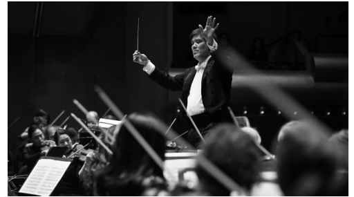
Alan Gilbert

Don't miss this opportunity to witness the new endeavor of NDR Elbphilharmonie Orchestra, the celebrated orchestra from Germany with their newly-welcomed genius conductor, Alan Gilbert.